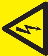
Example of a warning sign in Somali, which states – DANGER HIGH VOLTAGE ELECTRIC BARRIER